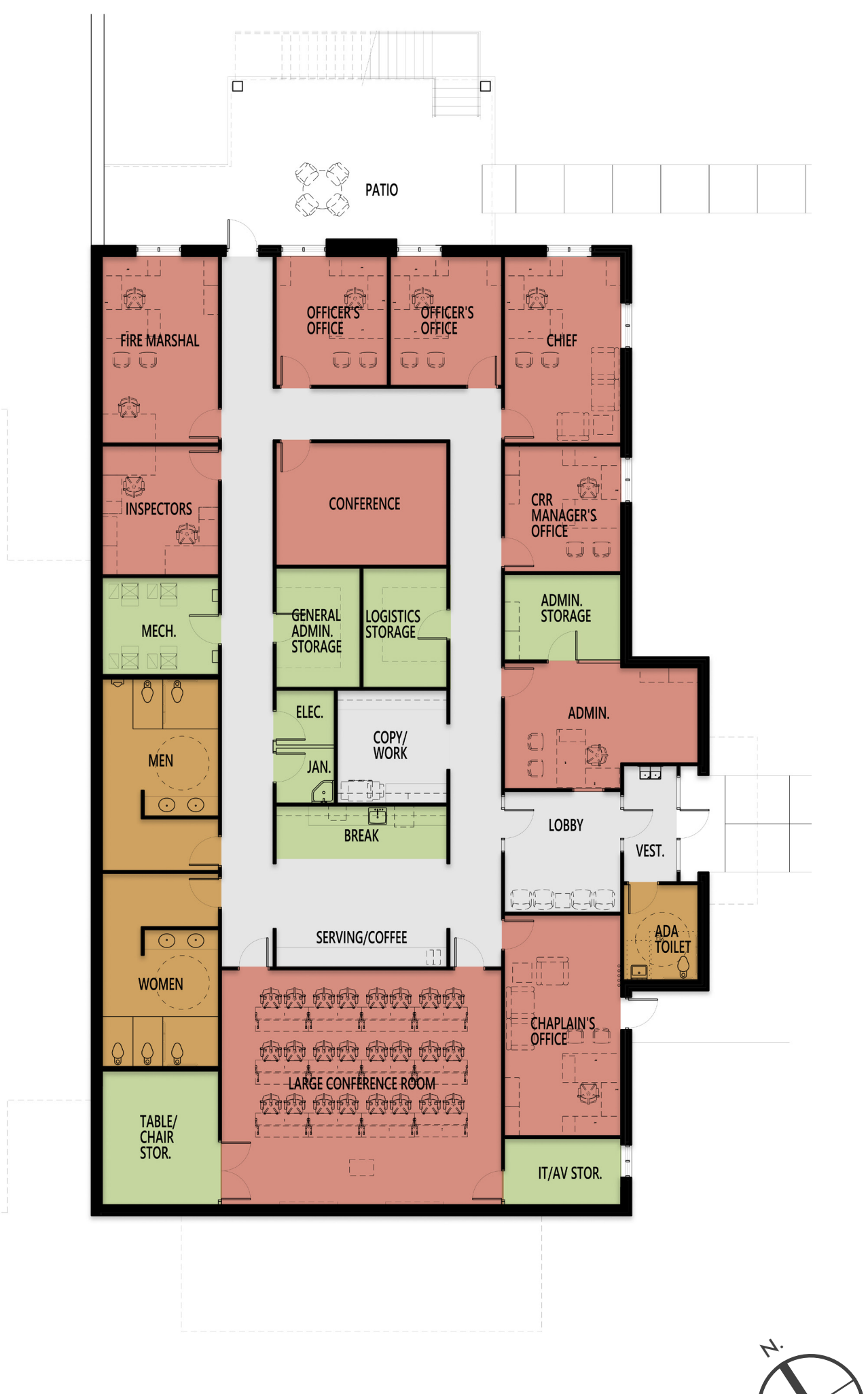
PLAN - LOWER LEVEL