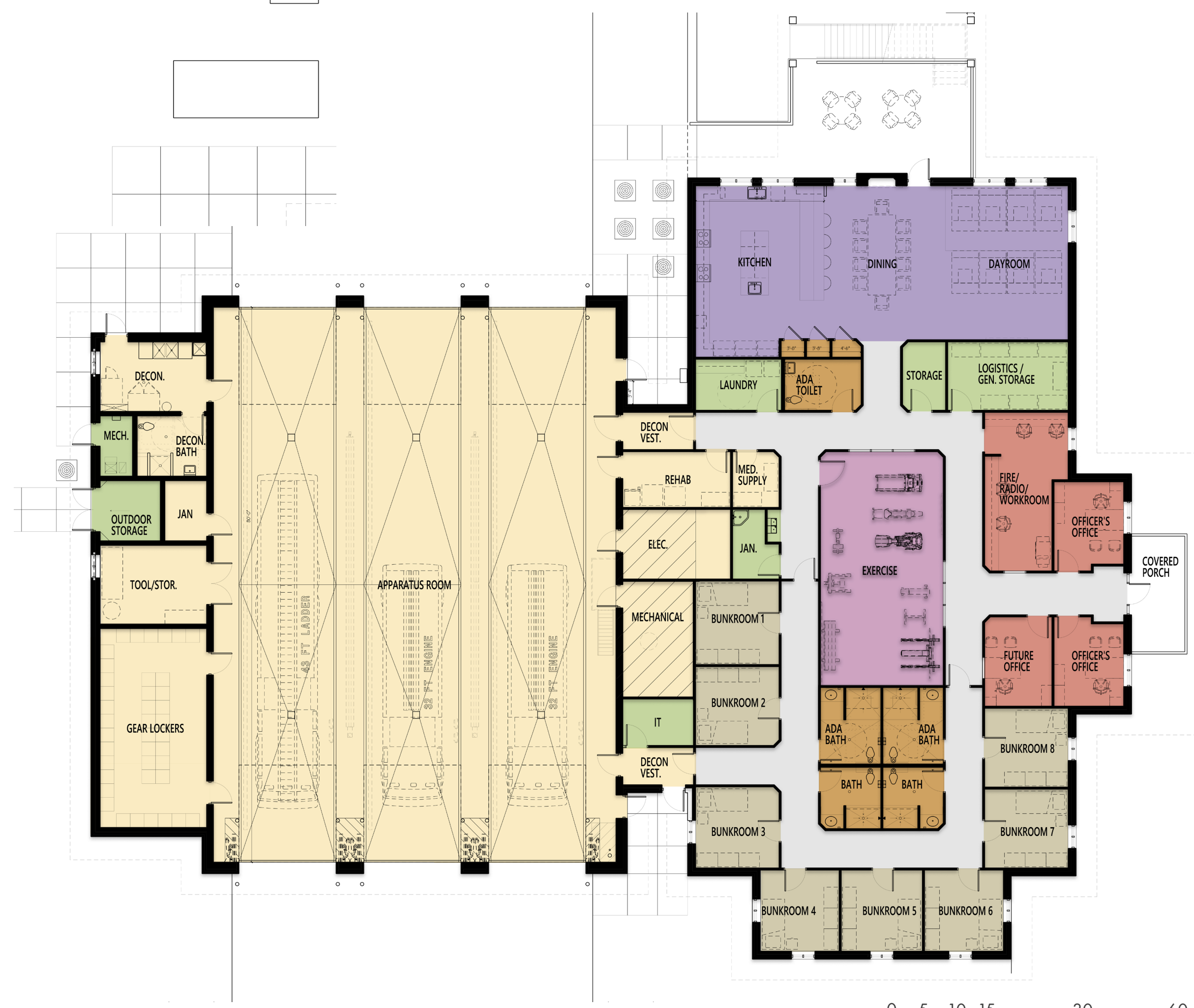
PLAN - UPPER LEVEL