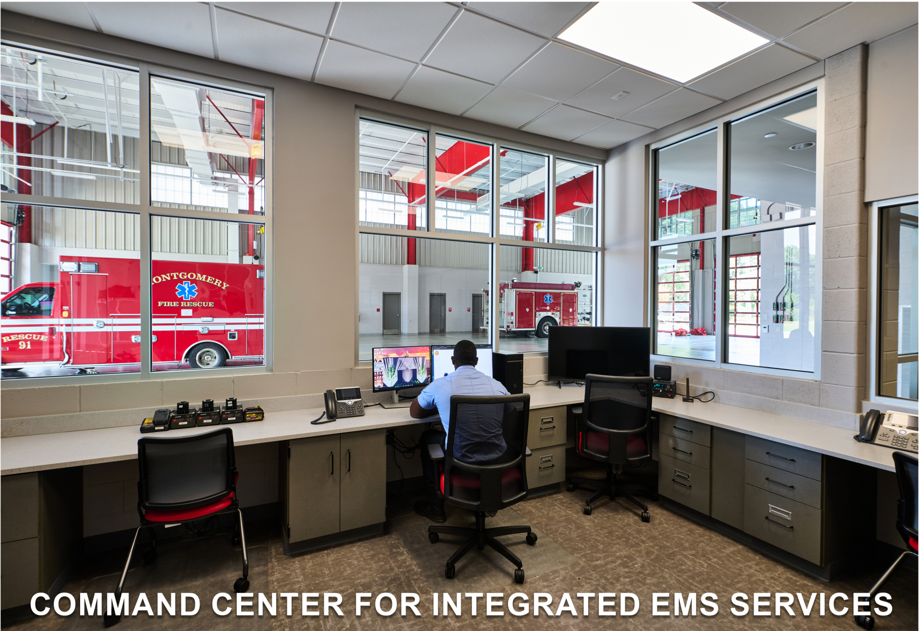
COMMAND CENTER FOR INTEGRATED EMS SERVICES