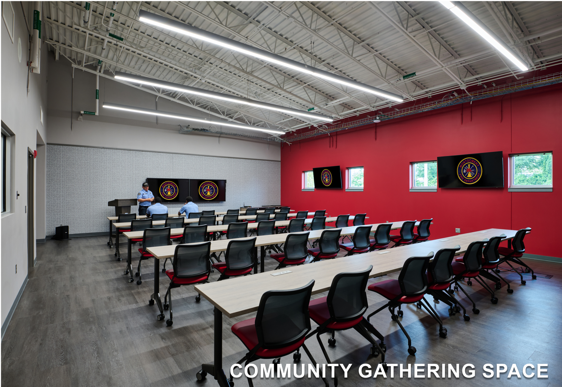
COMMUNITY GATHERING SPACE

Improves Emergency Response in the Underserved Area of West Montgomery