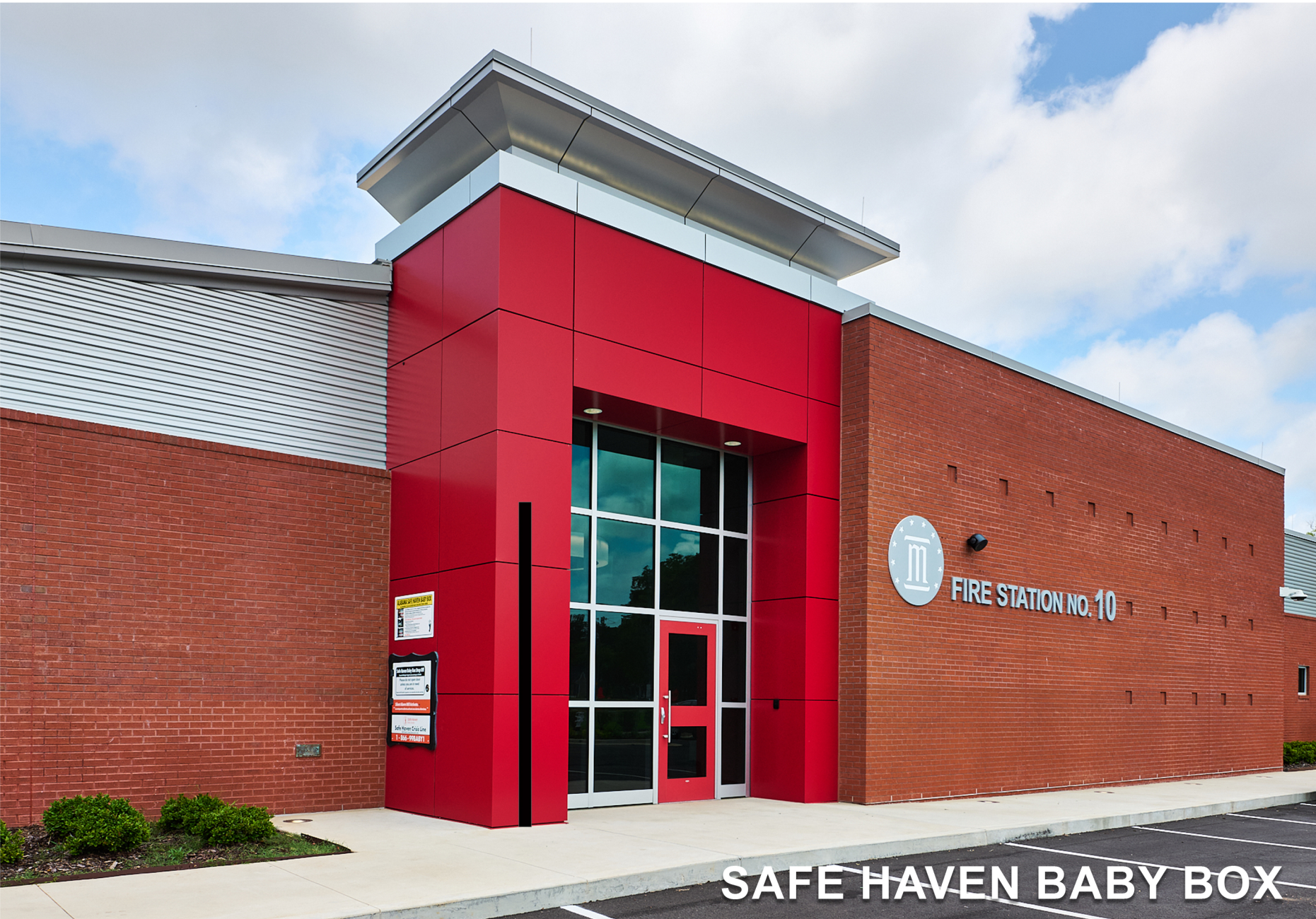
SAFE HAVEN BABY BOX